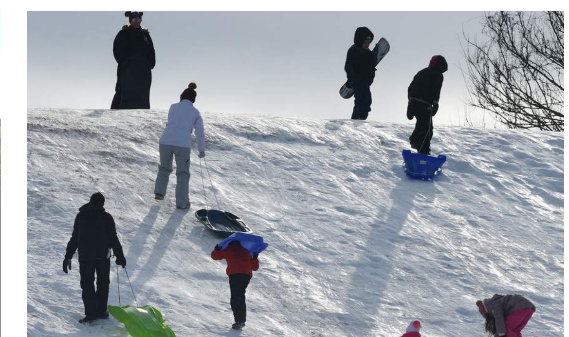
4 Sledding Hill