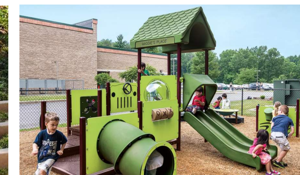
8 Toddler Playground