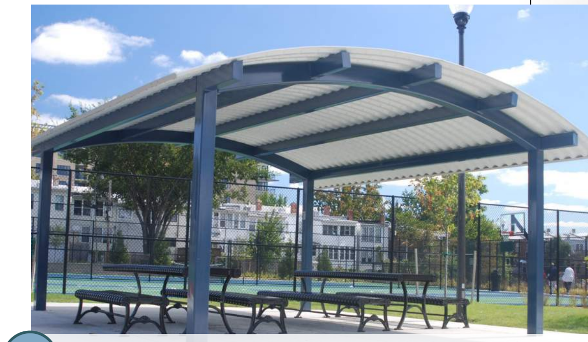
12 Shade Structure