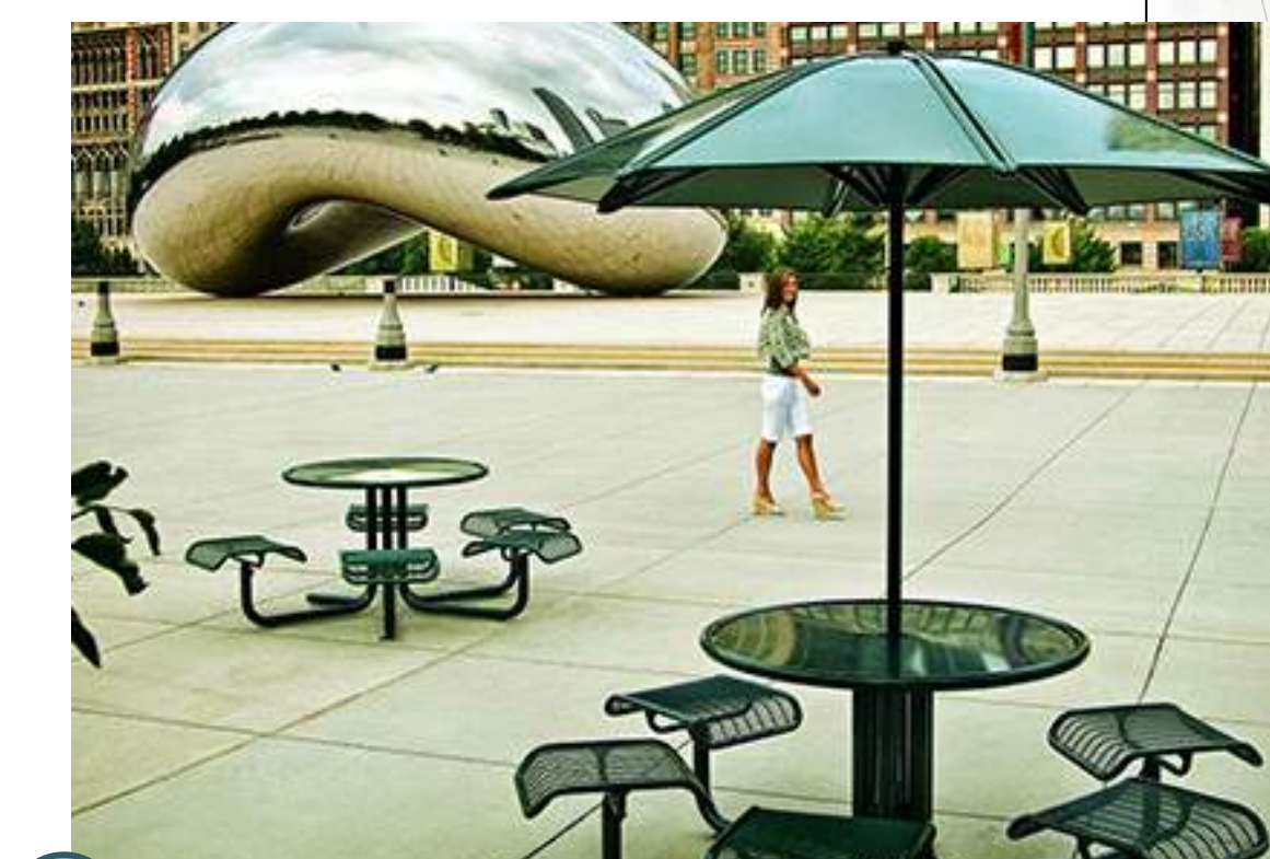
21 Table with Umbrella