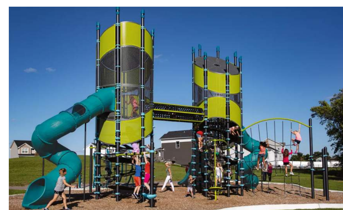
9 5-12 yrs. Playground