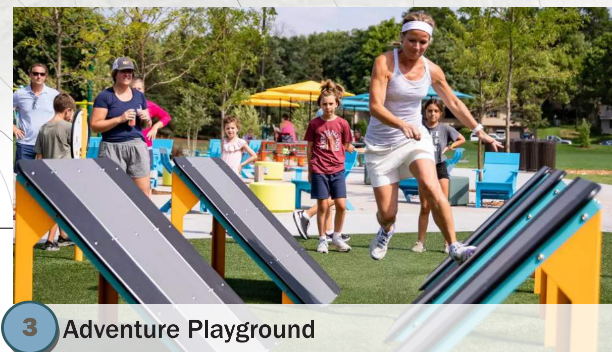
3 Adventure Playground