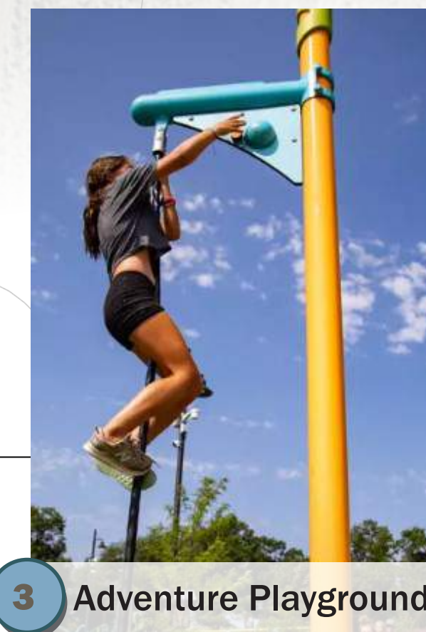
3 Adventure Playground