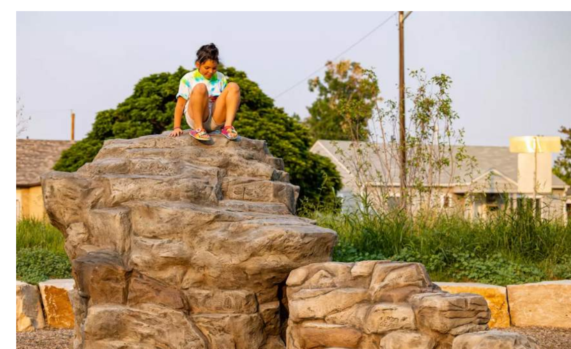
9 Climbing Rock