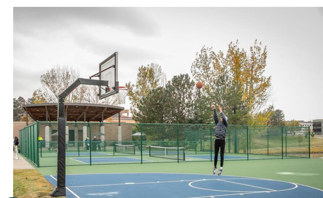
17 Basketball Half Court