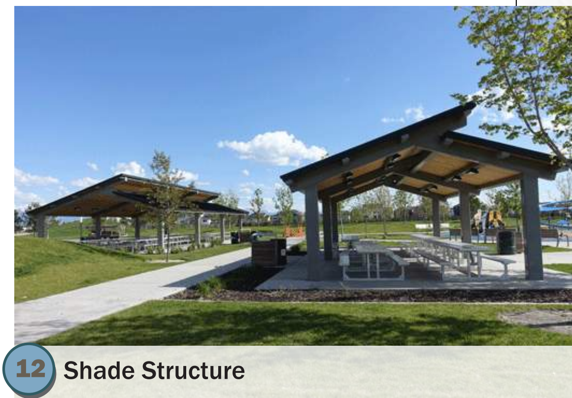
12 Shade Structure