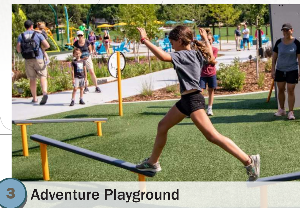
3 Adventure Playground